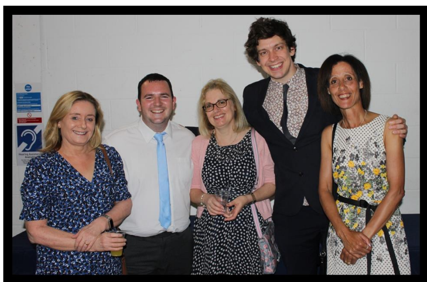
(Some members of the Learning Support Department celebrating many pupil's accomplishments at the Academy's Achievement Evening)

I wanted to say a huge thank you for all the hard (and patience!!!) you have given my son. You are all amazing and such a good inspiration to all young people. I have genuinely appreciated your help and support over the last 5 years.