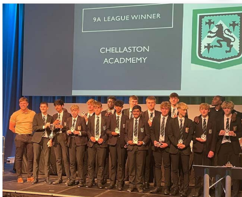
In June our Y9 and Y11 boys football teams were both announced as the Derby City Football League Winners 21/22