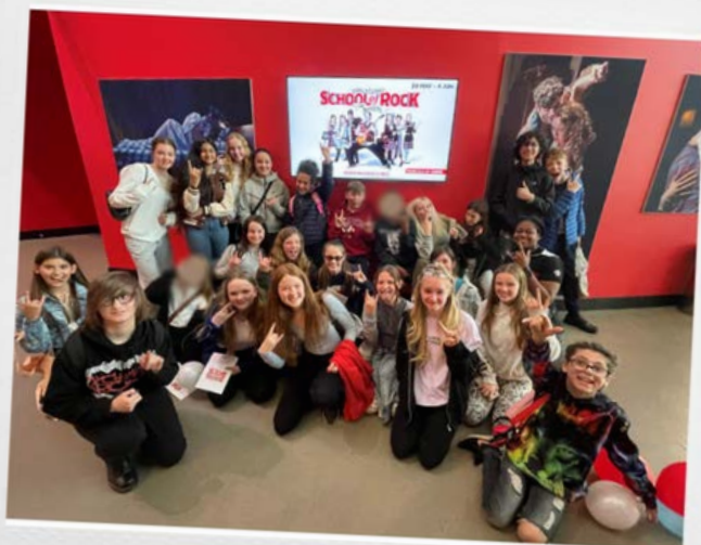
School of Rock