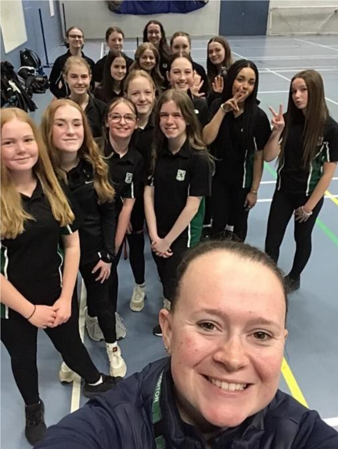
One-Day International against West Indies at The County Ground, on Friday 30 May 2025, donated by Derbyshire Cricket Foundation.